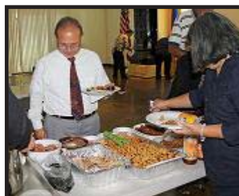
Father's Day Potluck!