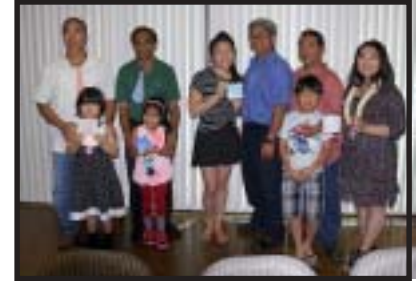
Lucky dads get to wear the ties made by the Dharma School class